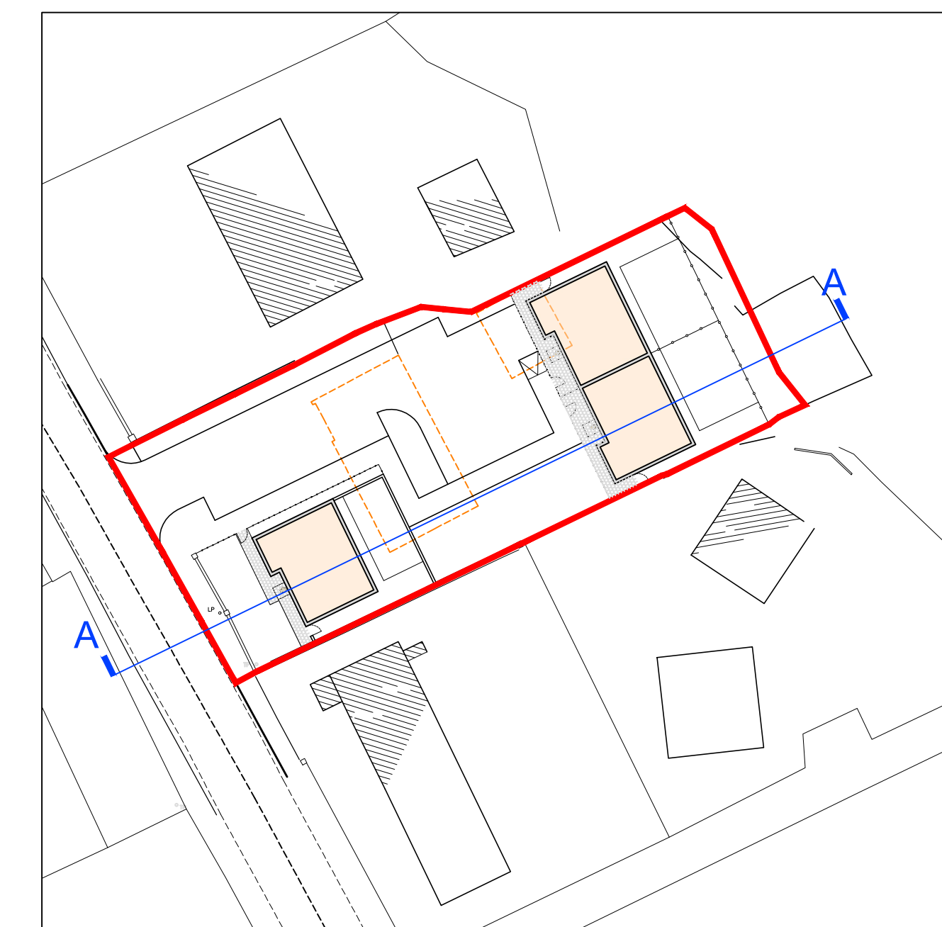
Keyplan Scale 1:500